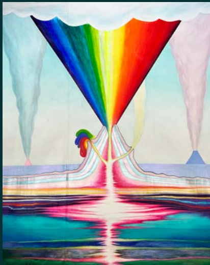
FASTWÜRMS, Rainbow Volcano Atoll #1 (Detail) , 2023 (Paul Petro Contemporary Art)

For much of the last century, the pull of gravity was the antithesis of a modernist idealization of the vertical picture plane, from Jean Arp's scattered scraps of paper to Richard Serra's thrown molten lead. Artists today have inherited this critical paradigm while wedding it to more urgent concerns: we continue to be pulled downward, but are now drawn toward the ground, toward issues of land sovereignty, ancestral knowledge, healing, the political economy of real estate, the undersides of domesticity and the labor of the handmade and assembled. Good Foot Forward brings together contemporary artists who, through their diverse practices, share an address to the earthbound, using this force to reflect upon our current forms of what constitutes a livable life.